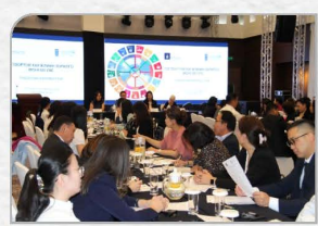
National consultation organized in 2019, comments from which were addressed in the draft