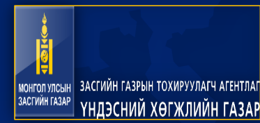
National Development Agency to ensure cross- sectoral coordination and localization of the SDGs through integrated development policy and planning