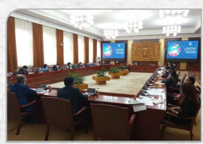
Draft discussed at the National Committee for Sustainable Development in May 2021