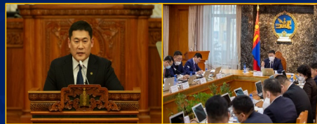
National Committee for Sustainable Development headed by the Prime Minister