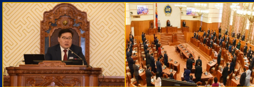
Sub-Committee on SDGs of the Parliament