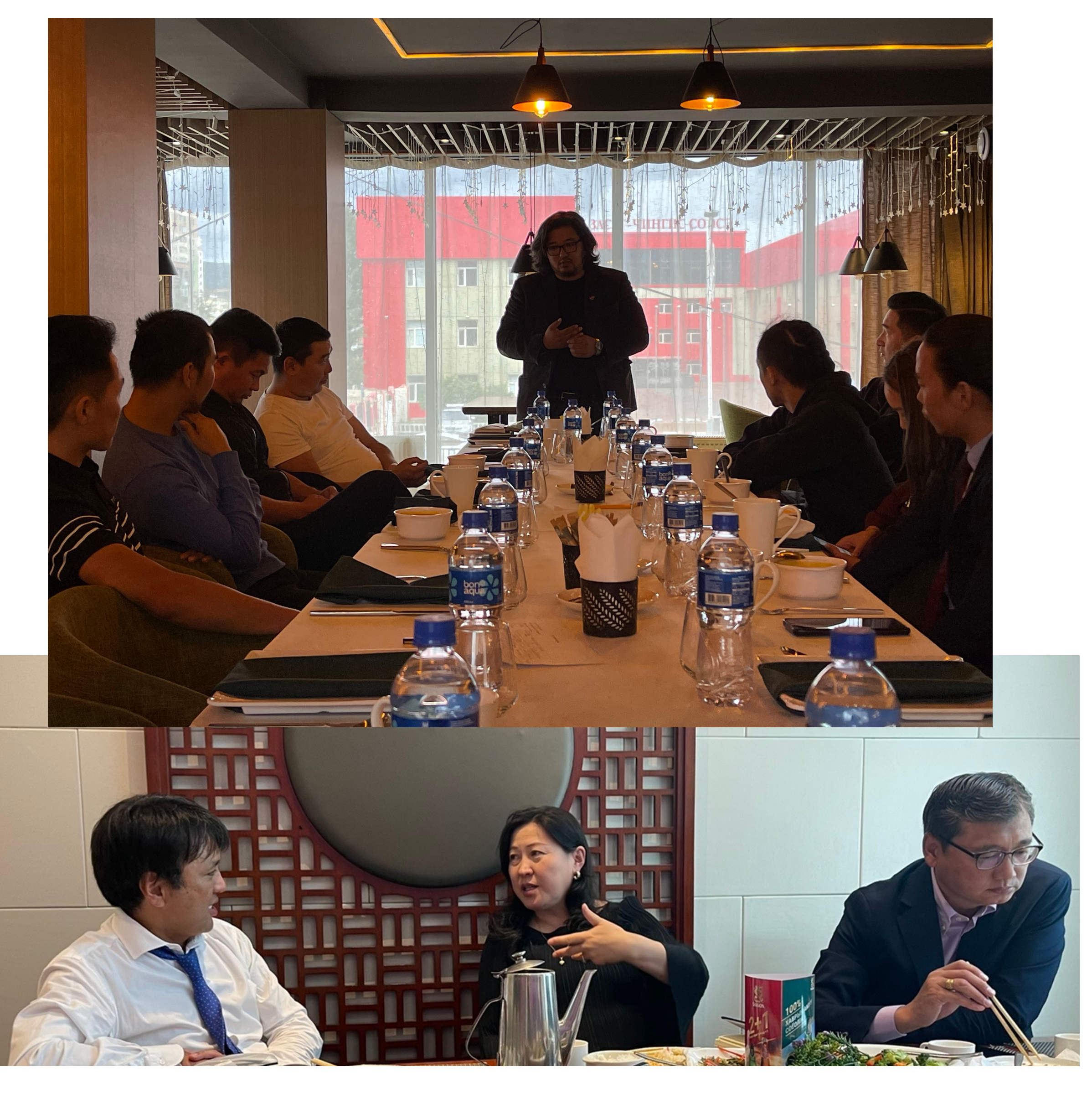
Men must be part of dialogue